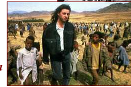
Geldof in Africa

10. When Geldof asked other musicians to help make the record, they _____.