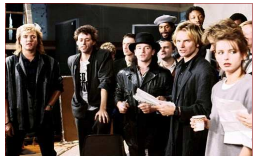
recording the song