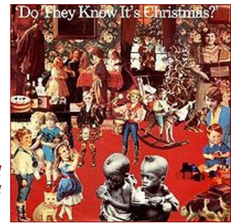
cover for the record by Peter Blake, 1984