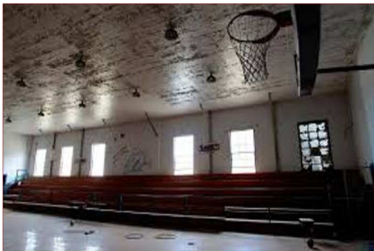
The Belleview Sports Centre gym needs painting.

And these teenagers came out to help the town collect money for the paint!